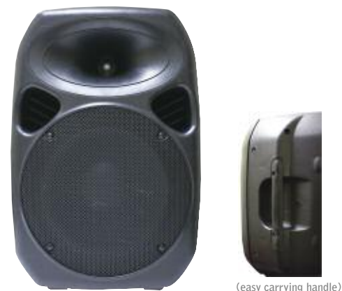
(easy carrying handle)